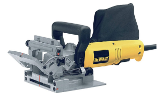
Plate Joiner /Biscuit Cutter. I use a DEWALT Plate Joiner Kit, 6.5-Amp (DW682K) About $170. Any brand is fine.

A glue gun is needed. I use the DeWalt Rapid Heat Ceramic glue gun mentioned about.